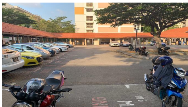
(b) Public HDB carpark at Blk 508