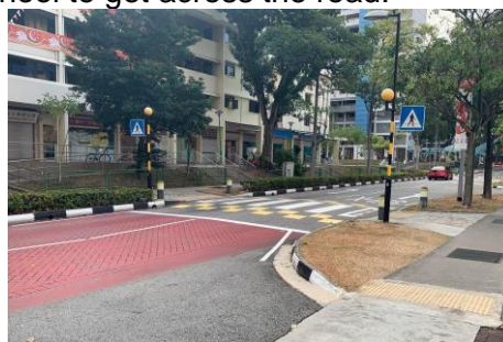
Zebra crossing in front of the school

The roads outside our school can be busy during peak hours. Please remind your child to use the zebra-crossing in front of the school to get across the road.