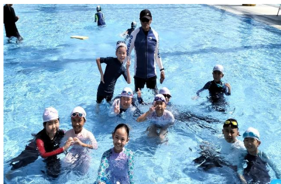
Our Primary 4 students building confidence and staying safe with SwimSafer 2.0!