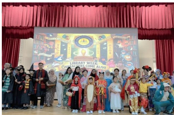
Library Week – where our vibrant characters from our favourite books came alive at YN!

As we press on through the remainder of Semester 1, let us continue to walk alongside our students with the same enthusiasm and dedication — cheering them on, guiding them forward, and celebrating every milestone along the way. Together, there is so much more we can achieve!