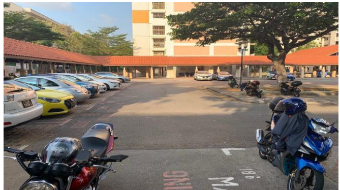
(b) Public HDB carpark at Blk 508 school