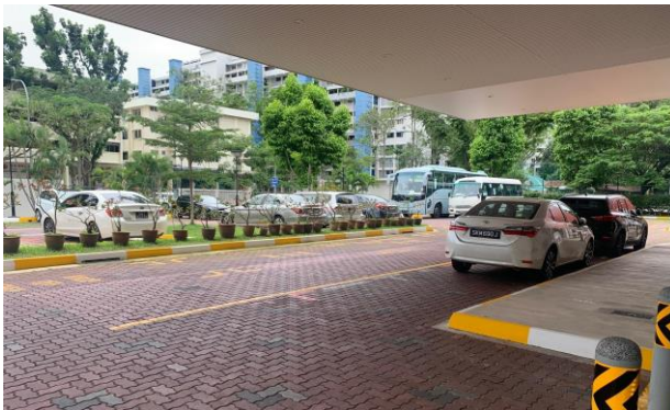
(a) Drive-through alighting point in school