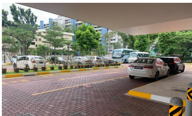
(a) Drive-through alighting point in

For the safety of your child and other road users, please do not alight your child along the road just outside our school main gates.