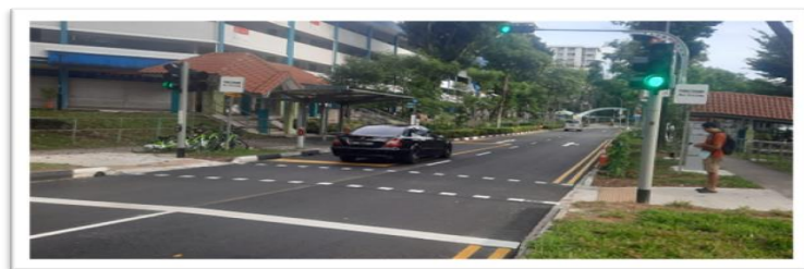
Traffic lights near the school

For students who are cycling to school, we strongly encourage them to wear a helmet that fits properly to protect their head from injury. They may park their bicycles at the designated lots nearest gate 4.